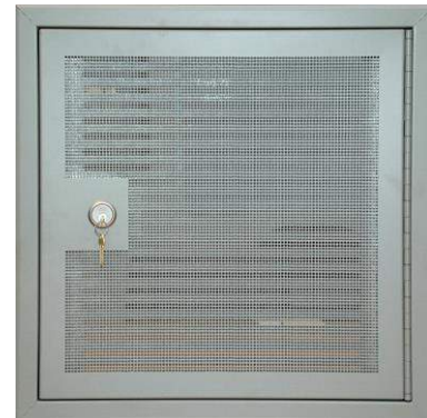
OPTIONAL: Grilled for natural ventilation

Also Available Trafalgar can custom manufacture to meet your specifications. Trafalgar also supply a comprehensive range of fire rated, metal, acoustic, customwood and speciality access panels.