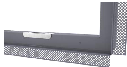
Wet Wall Frame (Set bead for plastering in)