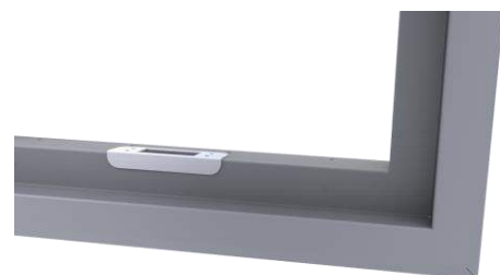
Flanged Edge Frame (Architrave / picture frame)